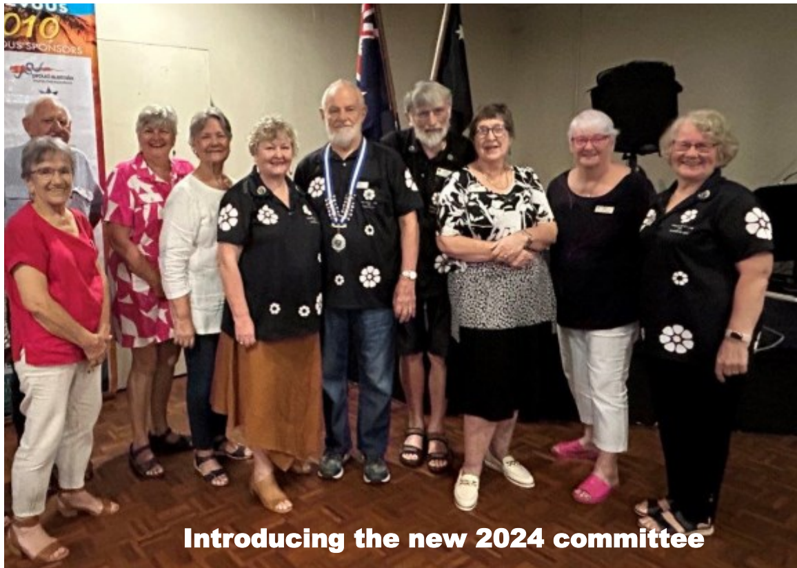
Introducing the new 2024 committee