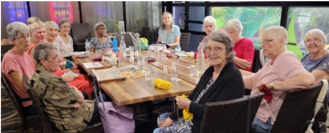
Craft Group Fridays at Casuarina Club