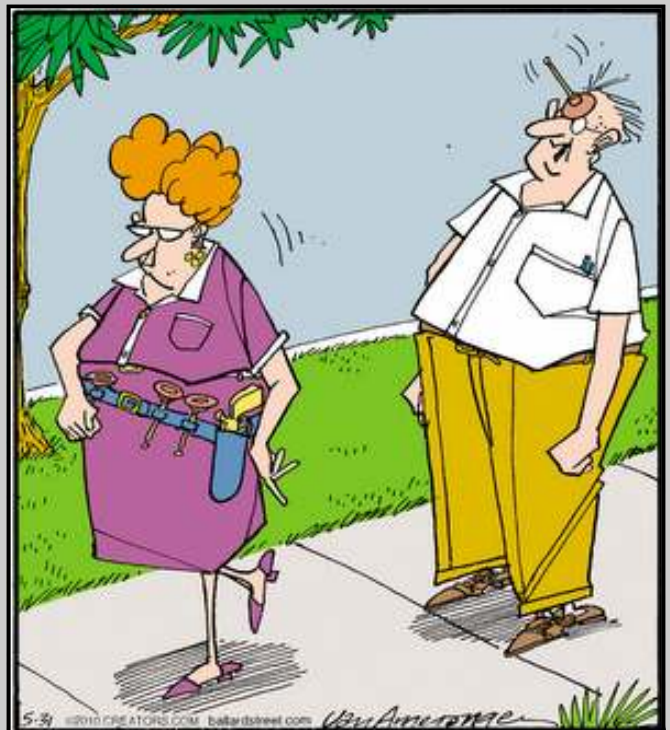
"Once again, that dart gun of yours alters the natural flow of an earnest discussion!"

I am also a Red Hatter and between baby sitting, Red Hatters, Probus and Casino (Seniors Day on a Monday), house sitting with my companion, Tara (black Kelpie cross) I am kept busy and enjoying myself.