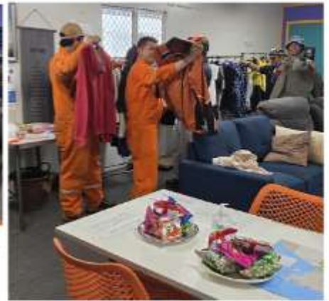
Relaxing in the Seafarer Welfare Centre