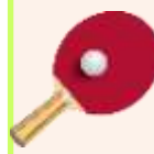
Table Tennis Interest Group