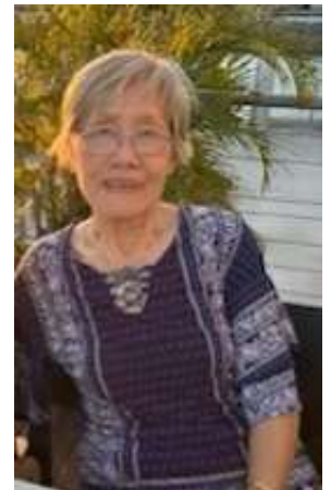
Dining out at Crustaceans at the Wharf.