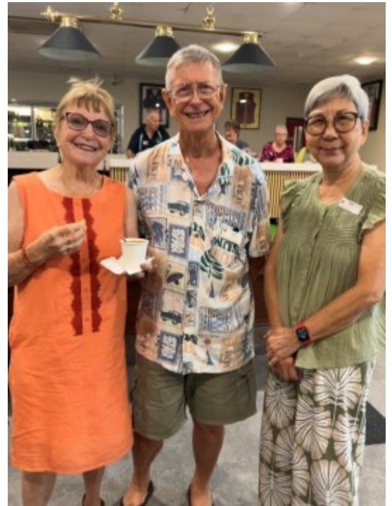
10 pin bowling