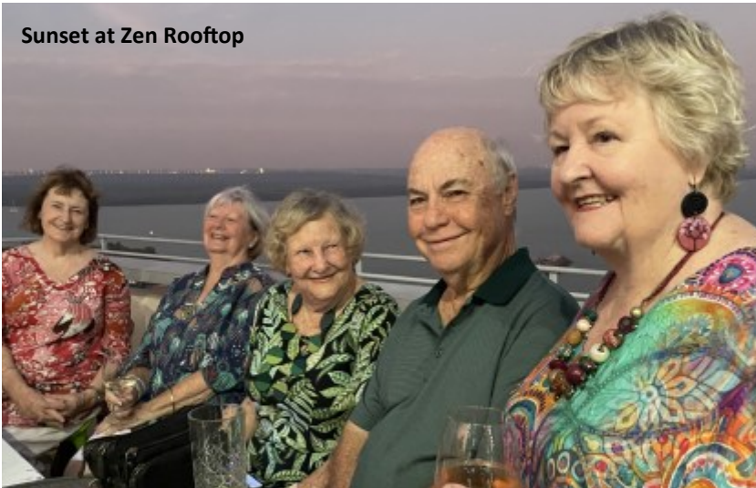
Sunset at Zen Rooftop