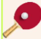
Table Tennis Interest Group

Every Thursday 9.00 am—11.00 am $5— 2 hours including bat and ball hire.