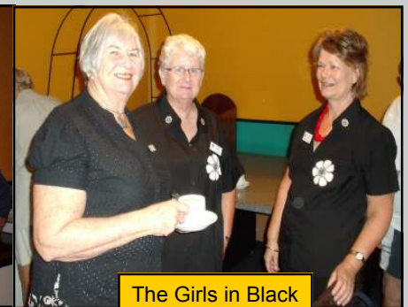
The Girls in Black