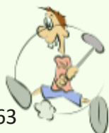
Table Tennis Interest Group